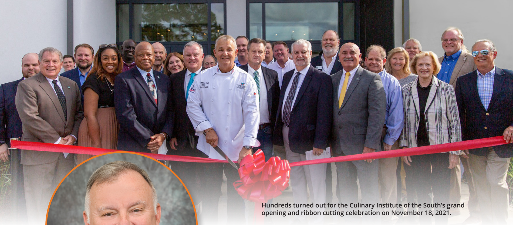
Hundreds turned out for the Culinary Institute of the South's grand opening and ribbon cutting celebration on November 18, 2021.