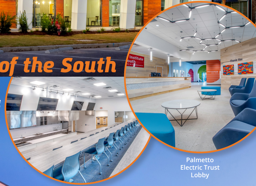
Palmetto Electric Trust Lobby