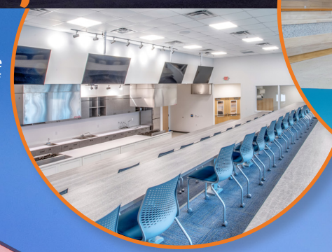
Montage Palmetto Bluff Auditorium