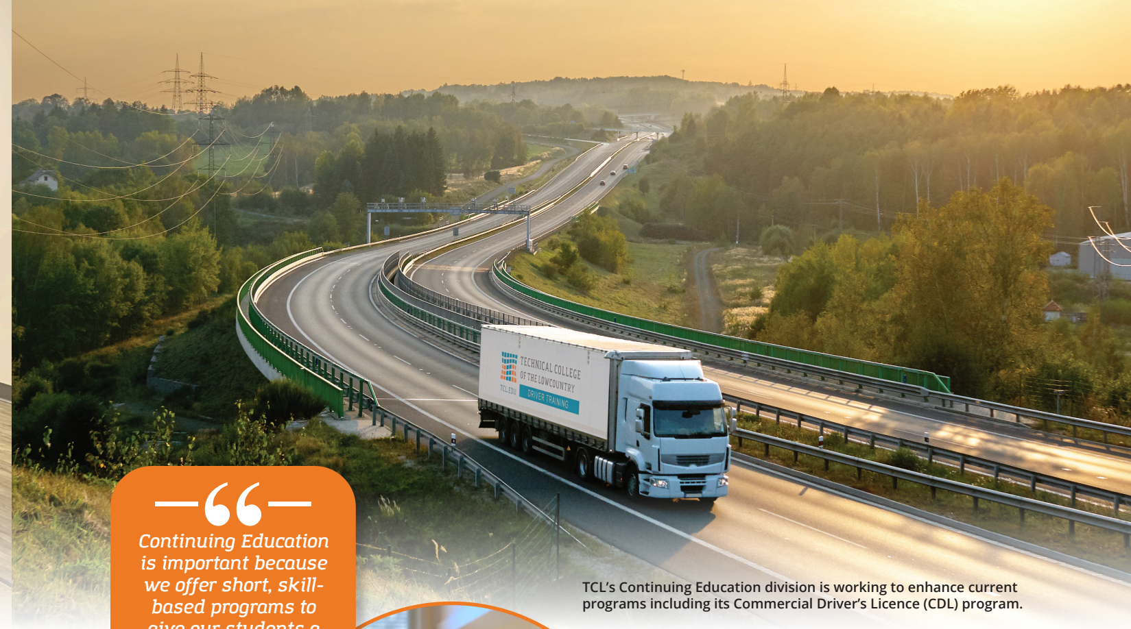
TCL's Continuing Education division is working to enhance current programs including its Commercial Driver's License (CDL) program.