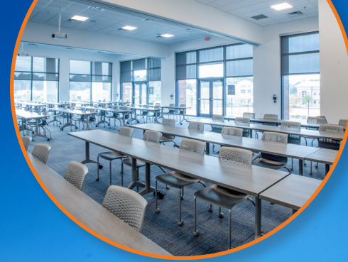
Second-floor Gillis Sampson Chiacchiero Ballroom