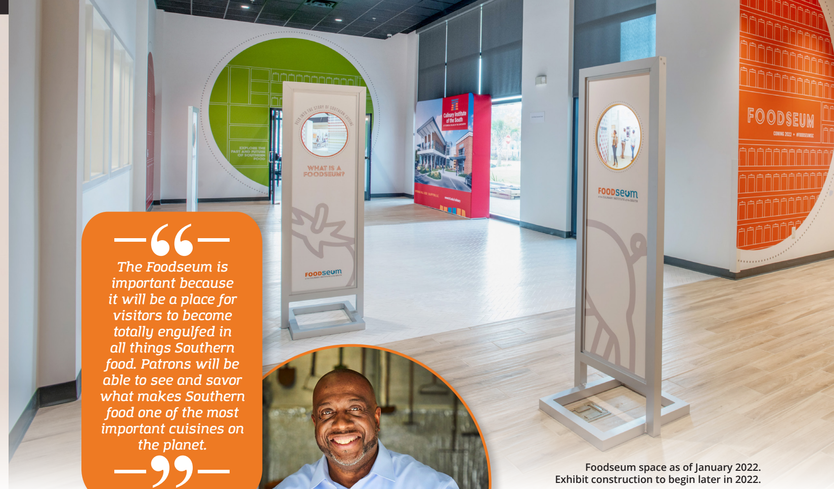
Foodseum space as of January 2022. Exhibit construction to begin later in 2022.