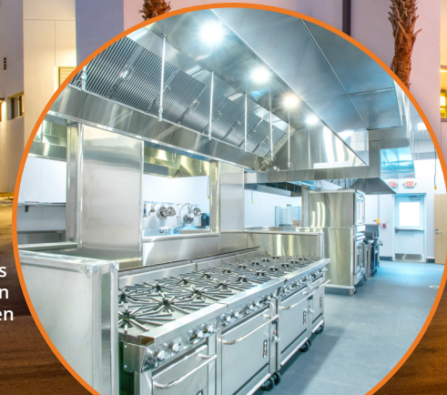
US Foods Innovation Kitchen